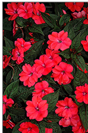
SunPatiens Compact Deep Rose New Guinea Impatiens flowers

This plant will require occasional maintenance and upkeep, and should not require much pruning, except when necessary, such as to remove dieback. It is a good choice for attracting bees and butterflies to your yard. It has no significant negative characteristics.