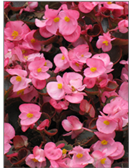
Bada Boom Pink Begonia flowers