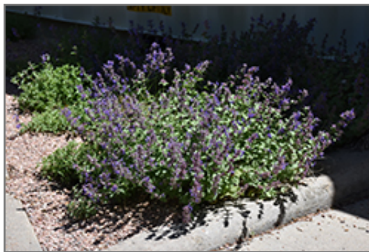
Little Trudy Catmint in bloom