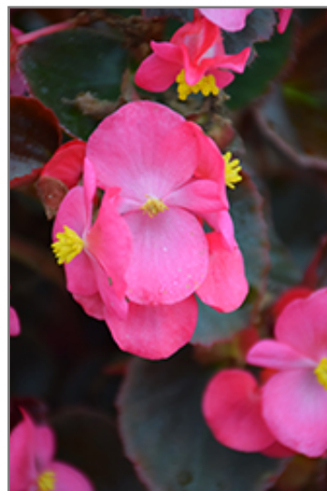
Bada Boom Rose Begonia flowers