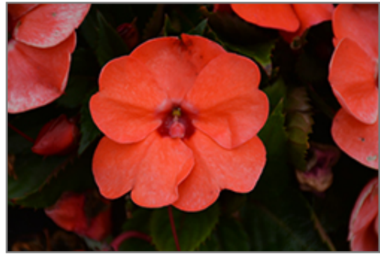
SunPatiens Compact Hot Coral New Guinea Impatiens flowers

This plant will require occasional maintenance and upkeep, and should not require much pruning, except when necessary, such as to remove dieback. It is a good choice for attracting bees and butterflies to your yard. It has no significant negative characteristics.