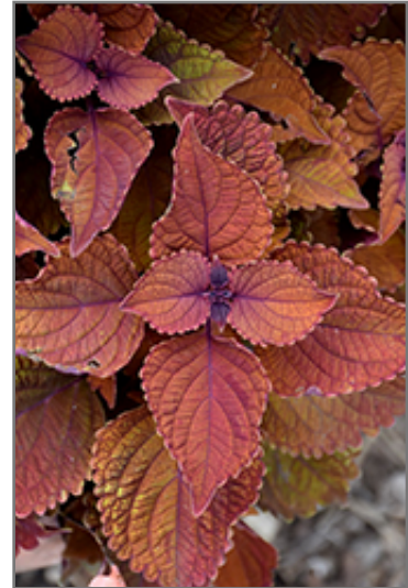
Wall Street Coleus foliage