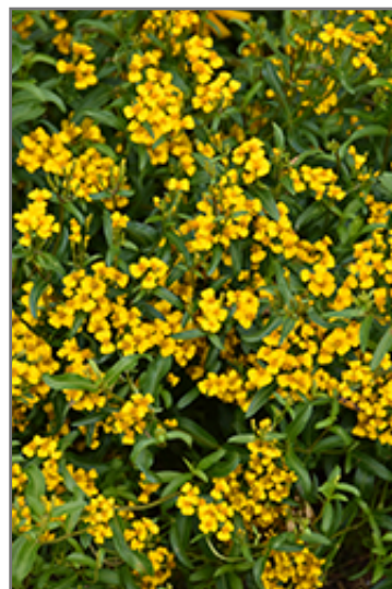
Mexican Tarragon flowers

Mexican Tarragon will grow to be about 30 inches tall at maturity, with a spread of 18 inches. Its foliage tends to remain dense right to the ground, not requiring facer plants in front. Although it's not a true annual, this plant can be expected to behave as an annual in our climate if left outdoors over the winter, usually needing replacement the following year. As such, gardeners should take into consideration that it will perform differently than it would in its native habitat.