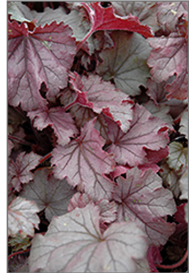
Little Cuties Sugar Berry Coral Bells foliage

Little Cuties Sugar Berry Coral Bells is recommended for the following landscape applications;