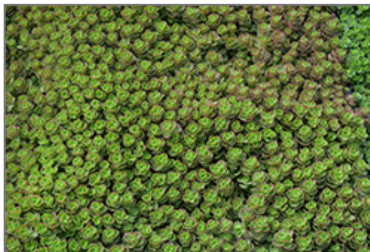
Dragon's Blood Stonecrop foliage