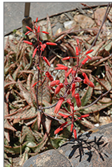
Pink Blush Aloe flowers