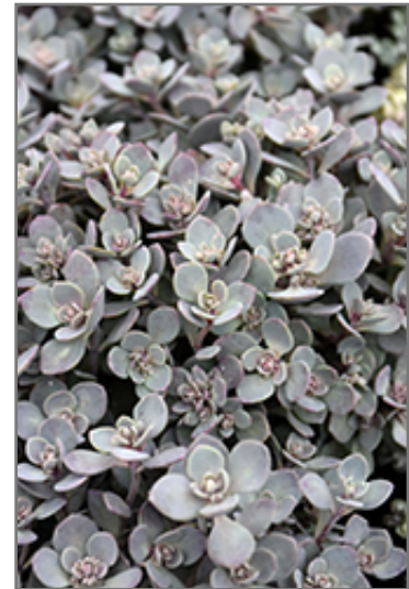
SunSparkler Blue Elf Sedoro foliage

SunSparkler Blue Elf Sedoro is a fine choice for the garden, but it is also a good selection for planting in outdoor pots and containers. Because of its spreading habit of growth, it is ideally suited for use as a 'spiller' in the 'spiller-thriller-filler' container combination; plant it near the edges where it can spill gracefully over the pot. Note that when growing plants in outdoor containers and baskets, they may require more frequent waterings than they would in the yard or garden.