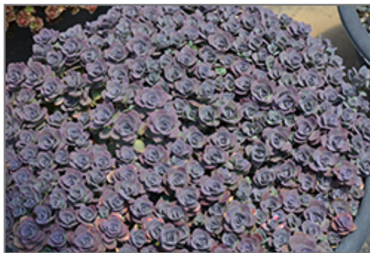
SunSparkler Blue Elf Sedoro