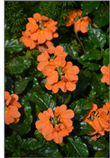
Orange Marmalade Firecracker Plant flowers

This plant does best in full sun to partial shade. It does best in average to evenly moist conditions, but will not tolerate standing water. It is not particular as to soil pH, but grows best in rich soils. It is somewhat tolerant of urban pollution. This is a selected variety of a species not originally from North America. It can be propagated by cuttings; however, as a cultivated variety, be aware that it may be subject to certain restrictions or prohibitions on propagation.