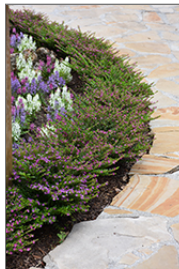
FloriGlory Diana Mexican Heather flowers

FloriGlory Diana Mexican Heather is recommended for the following landscape applications;