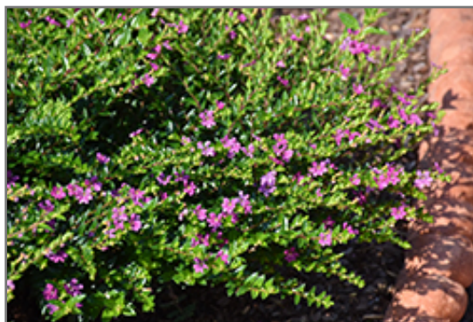
FloriGlory Diana Mexican Heather flowers

FloriGlory Diana Mexican Heather will grow to be about 14 inches tall at maturity, with a spread of 24 inches. When grown in masses or used as a bedding plant, individual plants should be spaced approximately 18 inches apart. Its foliage tends to remain dense right to the ground, not requiring facer plants in front. Although it's not a true annual, this fast-growing plant can be expected to behave as an annual in our climate if left outdoors over the winter, usually needing replacement the following year. As such, gardeners should take into consideration that it will perform differently than it would in its native habitat.