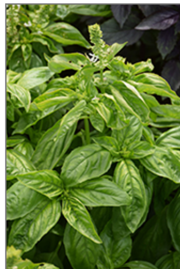
Genovese Basil foliage

Genovese Basil will grow to be about 20 inches tall at maturity, with a spread of 14 inches. When grown in masses or used as a bedding plant, individual plants should be spaced approximately 12 inches apart. This fast-growing annual will normally live for one full growing season, needing replacement the following year.