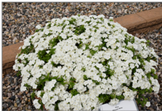
Phloxstar White Annual Phlox in bloom