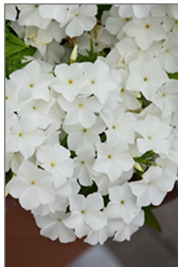
Phloxstar White Annual Phlox flowers

Phloxstar White Annual Phlox is recommended for the following landscape applications;