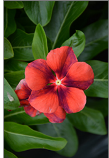
Tattoo Tangerine Vinca flowers

This plant will require occasional maintenance and upkeep, and should not require much pruning, except when necessary, such as to remove dieback. It is a good choice for attracting butterflies to your yard, but is not particularly attractive to deer who tend to leave it alone in favor of tastier treats. It has no significant negative characteristics.