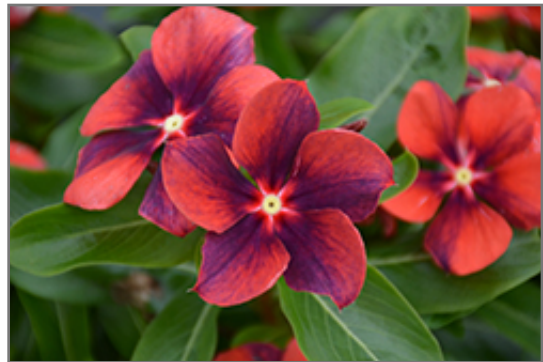
Tattoo Tangerine Vinca flowers