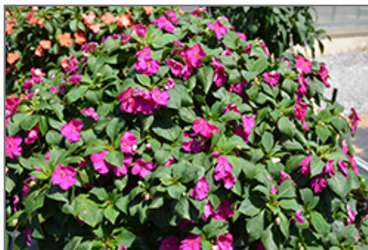
Beacon Violet Shades Impatiens in bloom

Beacon Violet Shades Impatiens will grow to be about 15 inches tall at maturity, with a spread of 12 inches. When grown in masses or used as a bedding plant, individual plants should be spaced approximately 8 inches apart. Its foliage tends to remain dense right to the ground, not requiring facer plants in front. This fast-growing annual will normally live for one full growing season, needing replacement the following year.