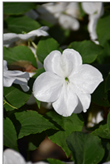
Beacon White Impatiens flowers

Beacon White Impatiens is recommended for the following landscape applications;