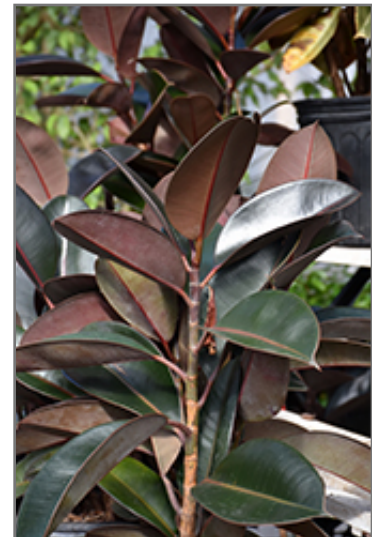
Burgundy Rubber Tree foliage