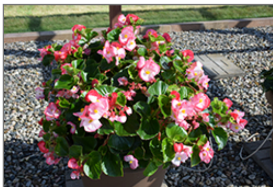
Tophat Rose Bicolor Begonia flowers