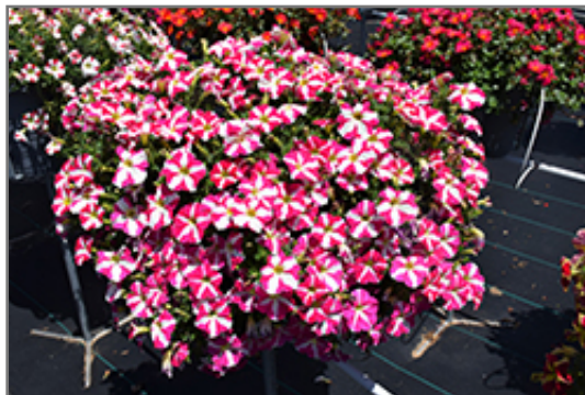
Amore Pink Heart Petunia in bloom

Amore Pink Heart Petunia will grow to be about 12 inches tall at maturity, with a spread of 14 inches. When grown in masses or used as a bedding plant, individual plants should be spaced approximately 10 inches apart. Its foliage tends to remain dense right to the ground, not requiring facer plants in front. This fast-growing annual will normally live for one full growing season, needing replacement the following year.