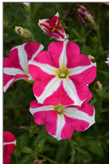
Amore Pink Heart Petunia flowers