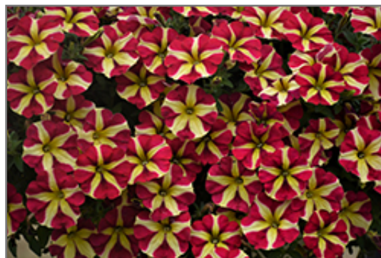
Amore Queen of Hearts Petunia flowers