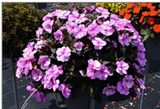
SunPatiens Vigorous Lavender Splash New Guinea Impatiens in bloom

SunPatiens Vigorous Lavender Splash New Guinea Impatiens is a fine choice for the garden, but it is also a good selection for planting in outdoor containers and hanging baskets. Because of its height, it is often used as a 'thriller' in the 'spiller-thriller-filler' container combination; plant it near the center of the pot, surrounded by smaller plants and those that spill over the edges. It is even sizeable enough that it can be grown alone in a suitable container. Note that when growing plants in outdoor containers and baskets, they may require more frequent waterings than they would in the yard or garden.