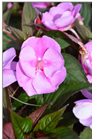
SunPatiens Vigorous Lavender Splash New Guinea Impatiens flowers