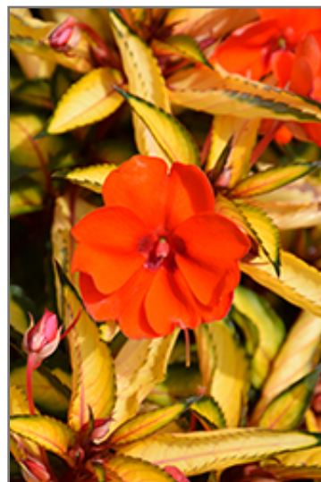
SunPatiens Vigorous Tropical Orange New Guinea Impatiens flowers

This plant will require occasional maintenance and upkeep, and should not require much pruning, except when necessary, such as to remove dieback. It has no significant negative characteristics.