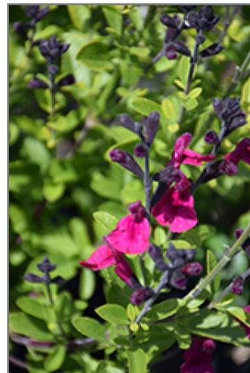
Vibe Ignition Fuchsia Sage flowers

Vibe Ignition Fuchsia Sage is a fine choice for the garden, but it is also a good selection for planting in outdoor pots and containers. With its upright habit of growth, it is best suited for use as a 'thriller' in the 'spiller-thriller-filler' container combination; plant it near the center of the pot, surrounded by smaller plants and those that spill over the edges. Note that when growing plants in outdoor containers and baskets, they may require more frequent waterings than they would in the yard or garden.