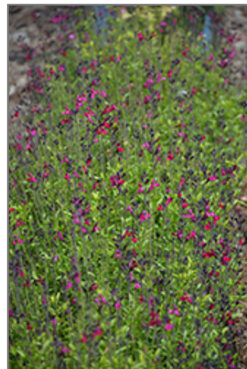
Vibe Ignition Fuchsia Sage in bloom