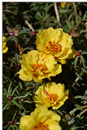
Happy Hour Banana Portulaca flowers

Happy Hour Banana Portulaca is recommended for the following landscape applications;