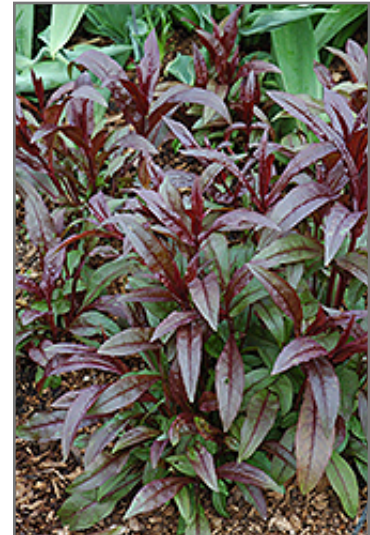
Husker Red Beard Tongue foliage