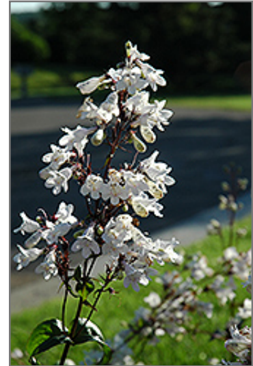
Husker Red Beard Tongue flowers