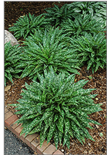
Raspberry Splash Lungwort