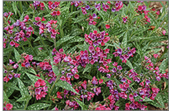
Raspberry Splash Lungwort flowers