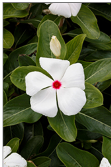
Cora Cascade Polka Dot Vinca flowers

Cora Cascade Polka Dot Vinca is recommended for the following landscape applications;