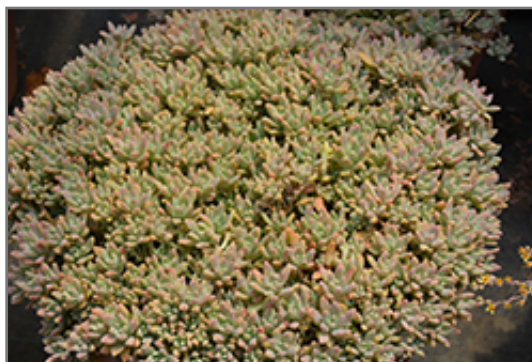
Darley Sunshine Graptosedum