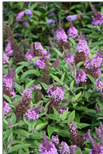
Chrysalis Pink Butterfly Bush flowers

Chrysalis Pink Butterfly Bush is recommended for the following landscape applications;