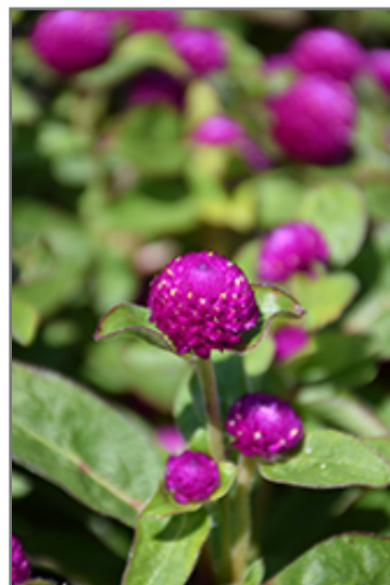
Gnome Purple Gomphrena flowers

Gnome Purple Gomphrena is recommended for the following landscape applications;