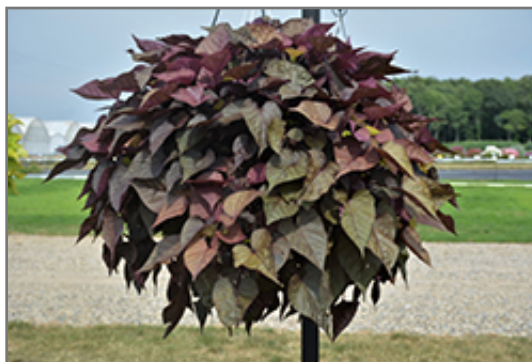
Floramia Rosso Sweet Potato Vine

Floramia Rosso Sweet Potato Vine is recommended for the following landscape applications;