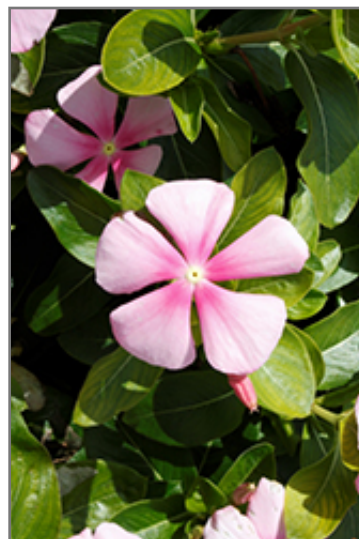
Pacifica XP Icy Pink Vinca flowers

Pacifica XP Icy Pink Vinca is recommended for the following landscape applications;