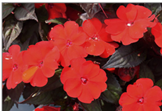
SunPatiens Compact Deep Red Impatiens flowers