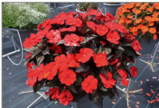
SunPatiens Compact Deep Red Impatiens in bloom

SunPatiens Compact Deep Red Impatiens is a fine choice for the garden, but it is also a good selection for planting in outdoor containers and hanging baskets. It can be used either as 'filler' or as a 'thriller' in the 'spiller-thriller-filler' container combination, depending on the height and form of the other plants used in the container planting. It is even sizeable enough that it can be grown alone in a suitable container. Note that when growing plants in outdoor containers and baskets, they may require more frequent waterings than they would in the yard or garden.