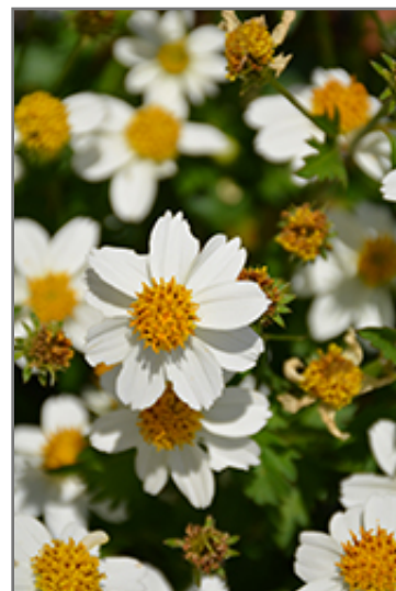
White Delight Bidens flowers

White Delight Bidens is recommended for the following landscape applications;