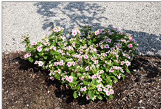
Soiree Flamenco Seniorita Pink Vinca in bloom

Soiree Flamenco Seniorita Pink Vinca is a fine choice for the garden, but it is also a good selection for planting in outdoor containers and hanging baskets. It is often used as a 'filler' in the 'spiller-thriller-filler' container combination, providing a mass of flowers against which the thriller plants stand out. Note that when growing plants in outdoor containers and baskets, they may require more frequent waterings than they would in the yard or garden.