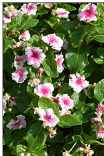
Soiree Flamenco Seniorita Pink Vinca in bloom

This plant will require occasional maintenance and upkeep, and should not require much pruning, except when necessary, such as to remove dieback. It is a good choice for attracting butterflies to your yard, but is not particularly attractive to deer who tend to leave it alone in favor of tastier treats. It has no significant negative characteristics.