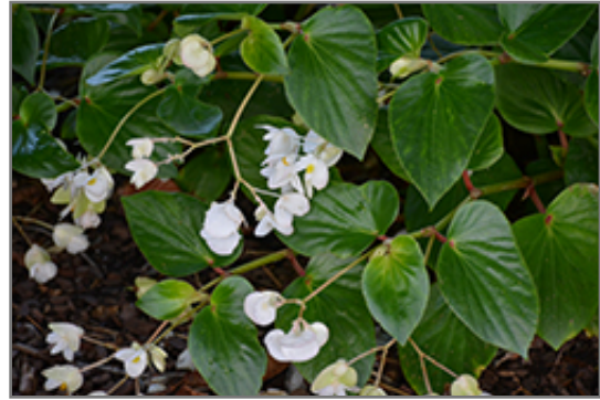
Dragon Wing White Begonia flowers

Dragon Wing White Begonia is recommended for the following landscape applications;