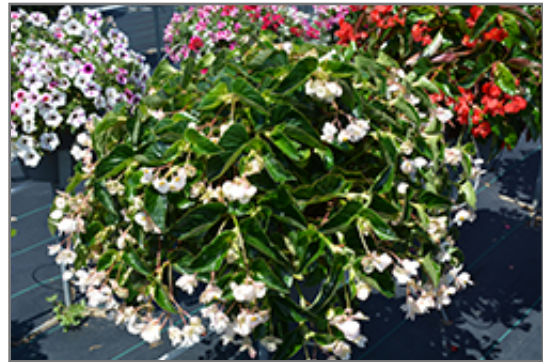
Dragon Wing White Begonia in bloom