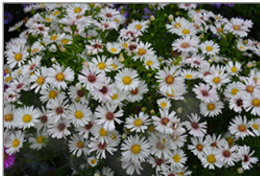
Puff White Aster flowers

Puff White Aster is recommended for the following landscape applications;