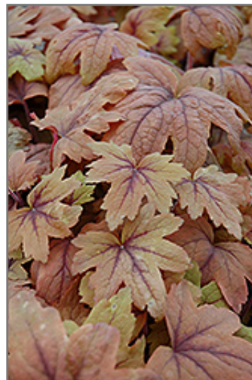
Sweet Tea Foamy Bells foliage