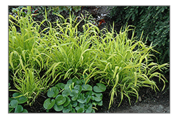
Golden Wood Millet Photo courtesy of NetPS Plant Finder

Golden Wood Millet is a dense herbaceous perennial with a shapely form and gracefully arching foliage. Its relatively fine texture sets it apart from other garden plants with less refined foliage.