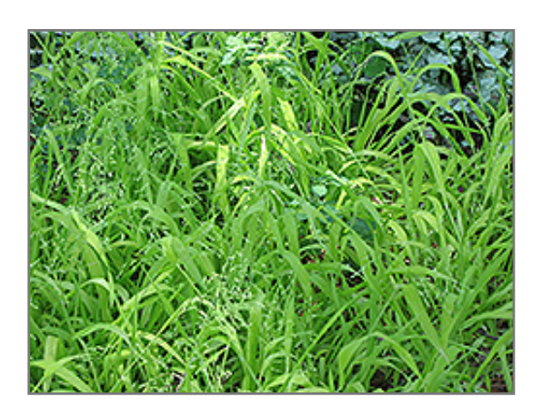
Golden Wood Millet foliage

This is a relatively low maintenance plant, and is best cleaned up in early spring before it resumes active growth for the season. It has no significant negative characteristics.