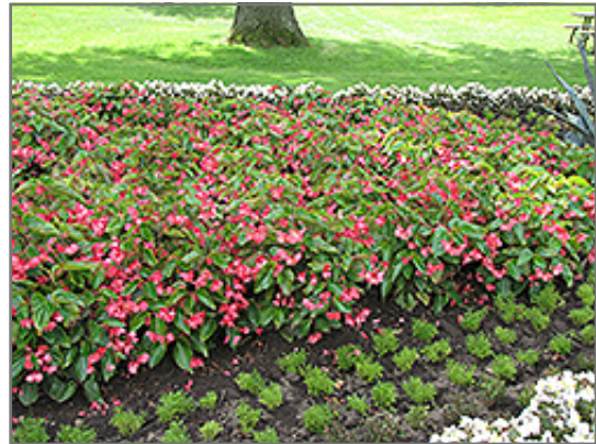
Dragon Wing Pink Begonia in bloom

Dragon Wing Pink Begonia is a fine choice for the garden, but it is also a good selection for planting in outdoor containers and hanging baskets. It is often used as a 'filler' in the 'spiller-thriller-filler' container combination, providing a mass of flowers and foliage against which the thriller plants stand out. Note that when growing plants in outdoor containers and baskets, they may require more frequent waterings than they would in the yard or garden.