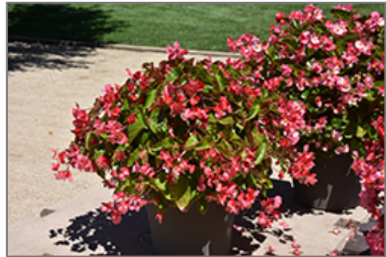
Dragon Wing Pink Begonia flowers