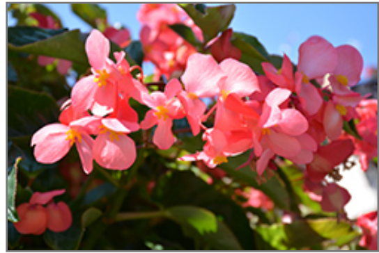
Dragon Wing Pink Begonia flowers

This is a high maintenance plant that will require regular care and upkeep, and usually looks its best without pruning, although it will tolerate pruning. Deer don't particularly care for this plant and will usually leave it alone in favor of tastier treats. Gardeners should be aware of the following characteristic(s) that may warrant special consideration;