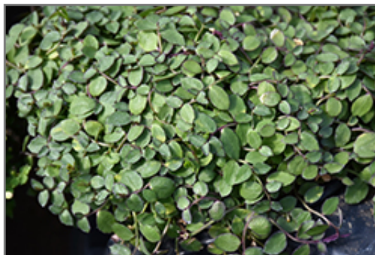
County Park Star Creeper foliage