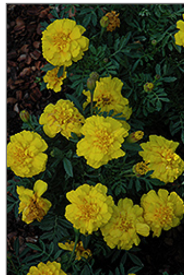
Alumia Yellow Marigold flowers