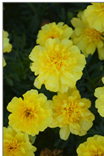
Alumia Yellow Marigold flowers