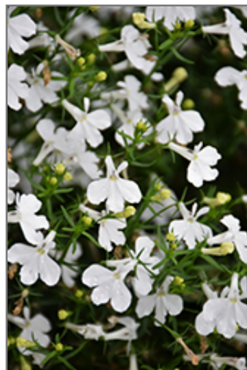
Bella Bianca Lobelia flowers