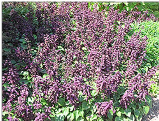
Vista Purple Sage in bloom