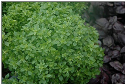
Aristotle Basil