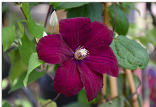
Rouge Cardinal Clematis flowers