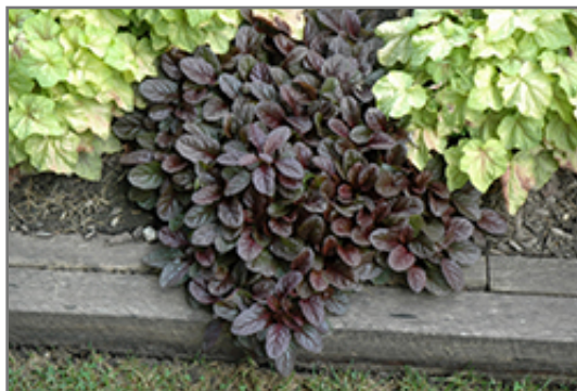
Mahogany Bugleweed