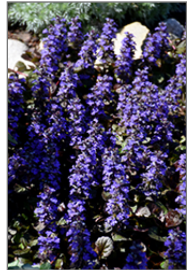
Mahogany Bugleweed flowers

This plant does best in partial shade to shade. It does best in average to evenly moist conditions, but will not tolerate standing water. It is not particular as to soil type or pH. It is somewhat tolerant of urban pollution. Consider covering it with a thick layer of mulch in winter to protect it in exposed locations or colder microclimates. This is a selected variety of a species not originally from North America. It can be propagated by division; however, as a cultivated variety, be aware that it may be subject to certain restrictions or prohibitions on propagation.