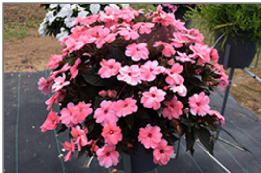
SunPatiens Compact Coral Pink New Guinea Impatiens in bloom